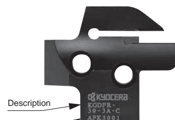
Description Lot No. Example of printing of blade number