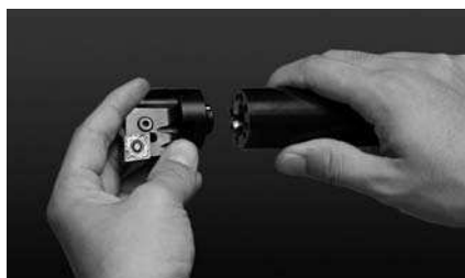
2. Align hole positions