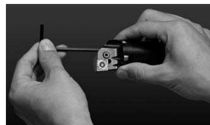
3. Tighten 3 bolts to attach the head

For lever lock type Interchangeable head, use 2 short bolts for upper side and 1 long bolt for lower side. For HA32 SCLC ® /L 09-40 and HA32 SDUC ® /L 11-40, use HH5 X 20 for all 3 bolts.