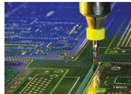
Printed Circuit Board