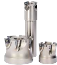
Steel Toolholders for Milling, Turning, Grooving, Threading and Drilling Metal