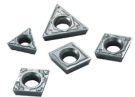
Indexable metal cutting inserts made of carbide, ceramic, cermet, Cubic Boron Nitride, and Polycrystalline diamond