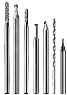
Solid carbide cutting tools for tight tolerance and micro-diameter metal cutting applications